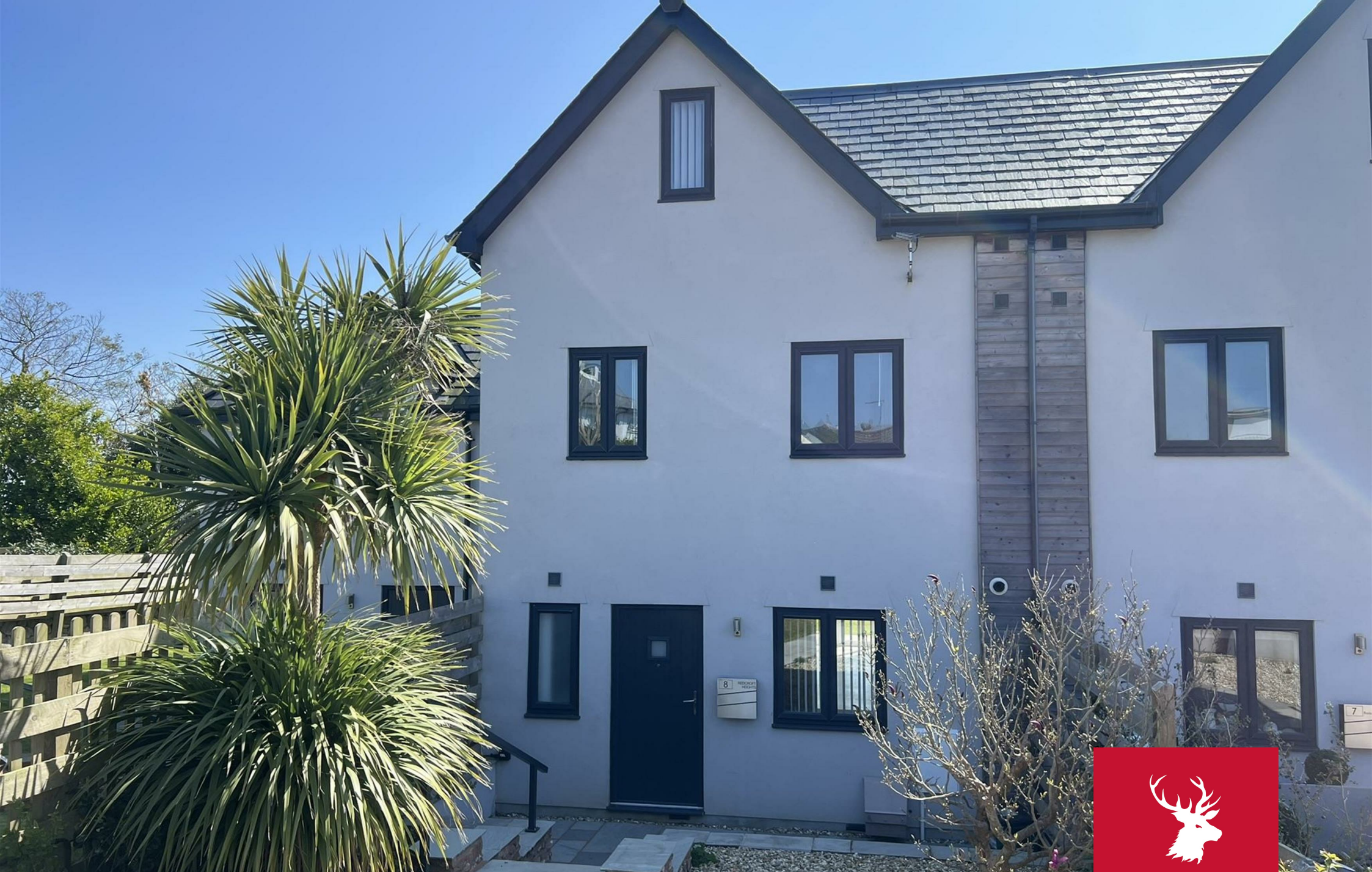
8 Redcroft Heights